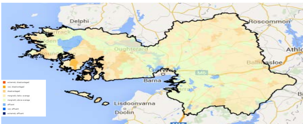
Figure 2: Analysis of Deprivation in County Galway 2011 (AIRO 2011)

The relative deprivation index for County Galway indicates an arc of disadvantage around the periphery of the County. The further the distance from Galway City or the core of the County the greater the levels of disadvantage. Our analysis shows that rural disadvantage can be found at all corners of the County and there are commonality of problems in this arc of disadvantage which starts on the Islands and continues through peripheral areas right around the County until one reaches the Burren Lowlands area. In the map below the darker blue areas are the most advantaged and the darker orange areas are electoral divisions areas with greater levels of deprivation.