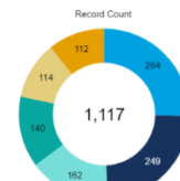
Groups by Municipal District

Municipal District ● Conamara ● Ballinasloe ● Loughrea ● Tuam ● Athenry-Cranmore ● County