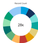
Emails Sent by Galway County PPN In the Current Year so far

Email Template Name ● Weekly_Digest_Thursday_10th_February ● Weekly_Digest_Friday_7th_January_2022 ● Weekly_Digest_Friday_4th_February ● Weekly_Digest_Friday_28th_January_2022 ● Weekly_Digest_Friday_21st_January_2022 ● Weekly_Digest_Friday_14th_January_2022 ● Weekly_Digest_18th_February ● Reminder_CAF_Funding_Webinar ● PPN_Training_for_community_groups ● Notice_of_Material_alterations_to_the_Draft_ ● January_PPN_newsletter_out_now