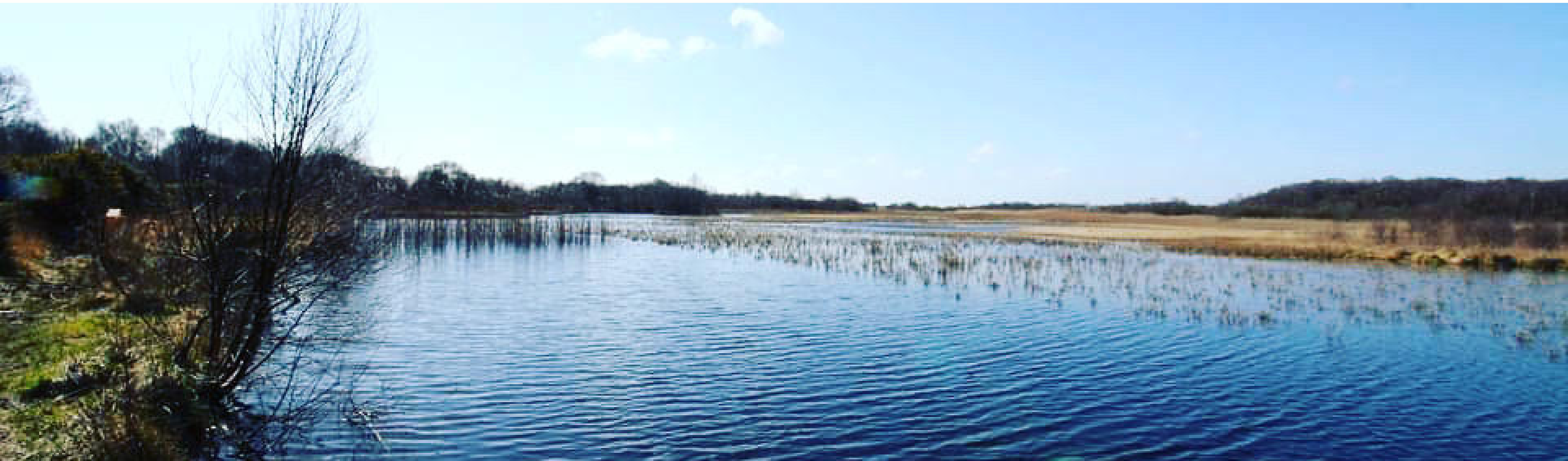
Image below shows Ballynafagh Lake in County Kildare. A blue stretch of water reaching to the skyline.