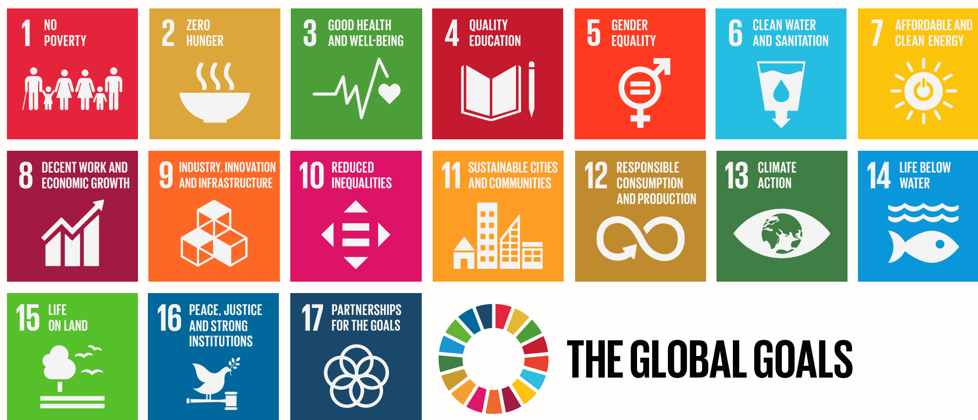
Image above shows the square #SDG icons and the round #SDG symbol.

The Sustainable Development Goals (SDGs), also known as Global Goals, are a set of 17 integrated and interrelated goals to end poverty, protect the planet and ensure that humanity enjoys peace and prosperity by 2030.